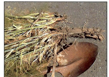
Common fennel removal

If the root breaks, be sure to remove the upper 3–6" portion, also known as the crown. Cutting and removing the crown just before the plant sets seed will reduce the number of sprouts from the remaining root portions.