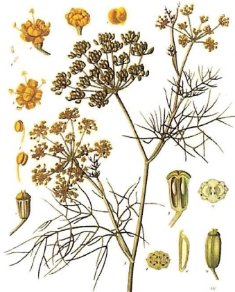
Common fennel plant parts

Impacts: Common fennel readily escapes cultivation. A single plant can produce thousands of seed during its initial year of establishment, and more than 100,000 in subsequent years. Seed remains viable in the soil for many years. The tap root can reach depths of 10 feet, allowing it to thrive during dry summer months. It often forms dense infestations that prevent the growth of vegetation critical for native wildlife habitat or other desired plants. It has become a weedy pest after escaping cultivated areas and infesting many disturbed waste areas, roadsides, and embankments throughout western Washington.