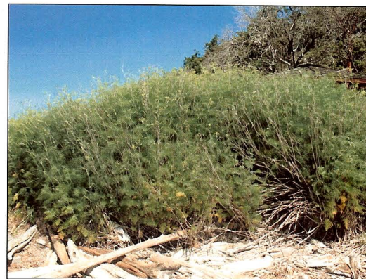
Common fennel infestations in Anacortes, June 2006